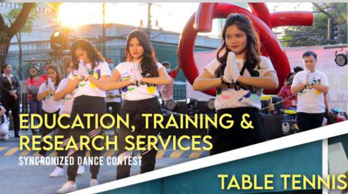
EDUCATION, TRAINING & RESEARCH SERVICES SYNCHRONIZED DANCE CONTEST