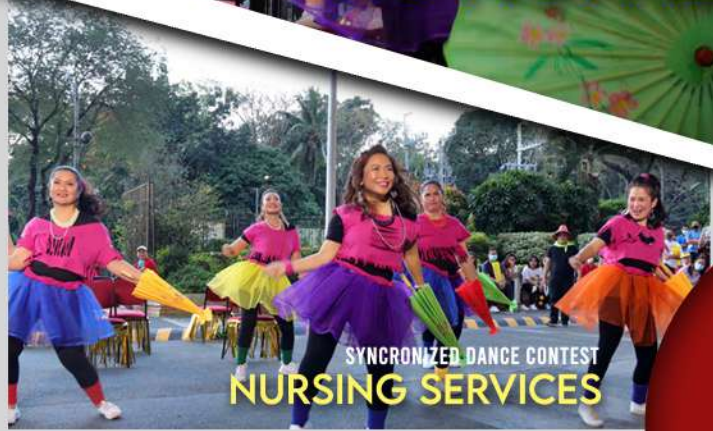
SYNCHRONIZED DANCE CONTEST NURSING SERVICES