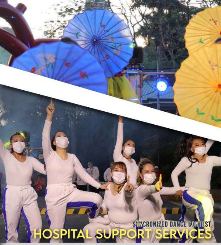
SYNCHRONIZED DANCE CONTEST HOSPITAL SUPPORT SERVICES