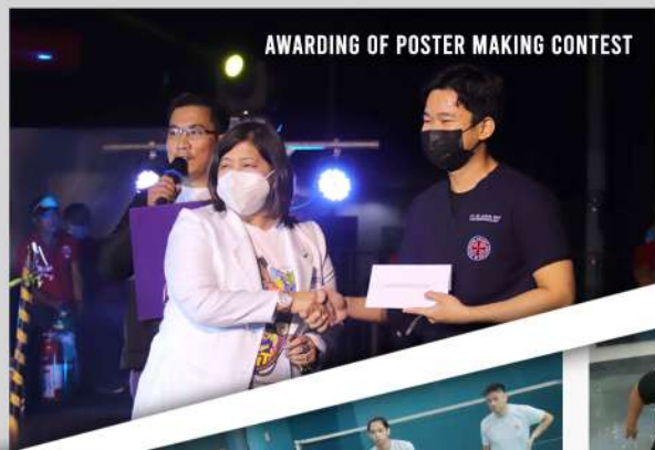
AWARDING OF POSTER MAKING CONTEST